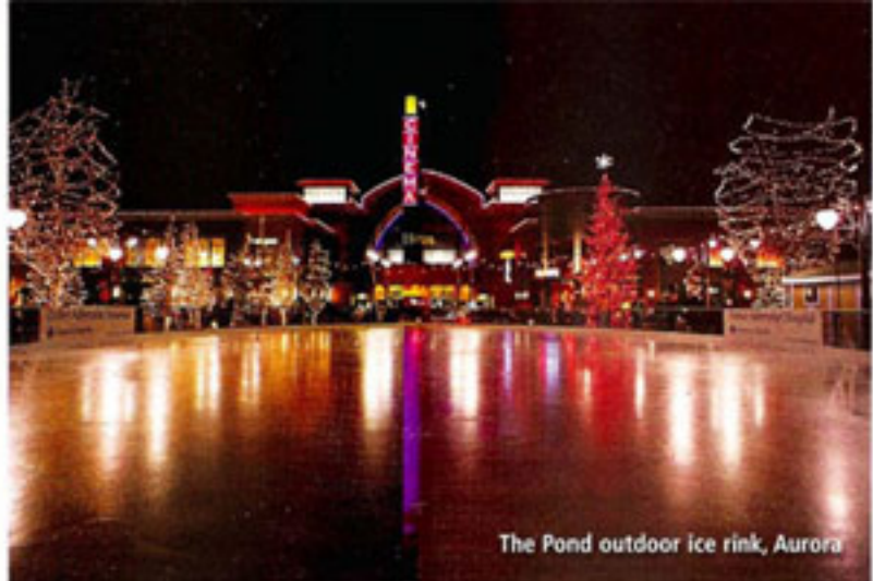
The Pond outdoor ice rink, Aurora

The Durango & Silverton Narrow Gauge Railroad makes its annual "Polar Express" runs, complete with reindeer and Santa, Nov. 26 through Dec. 28. Hot chocolate and treats are supplied to young passengers, who may wear their pajamas for the ride. Call 888-872-4607 for reservations.